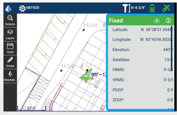
View your GPS accuracy in real-time