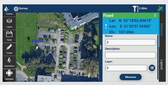
Take a measurement anywhere