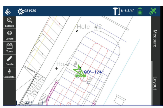
Bring CAD files to the field in .dwg or .dxf format