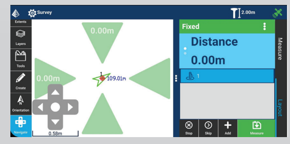
Sub-meter guides provide fast, precise staking

by Google and used according to terms described in the Creative Commons 3.0 Attribution License. All other product names or trademarks belong to their respective holders.